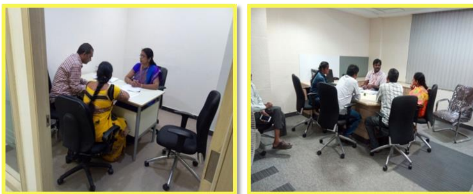
The H&S Team of class teachers interacting with parents.

Parent-teacher meeting supplements the information about the progress of the student through the report cards by focusing on students' specific strengths and weaknesses in individual subjects and generalizing the level of inter-curricular skills and competences.